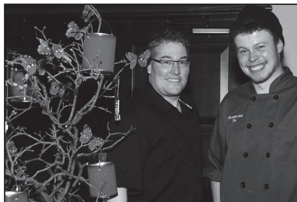
The Joint Café - one of the wonderful restaurants who catered the event - decorated their table to fit the theme of the evening. Thanks to The Joint Café, and to Hanlon Convention Centre, Kelsey's, The Other Brother's, Everton Academy of Culinary Arts, Montana's Cookhouse. Moxie's, and Shakespeare Arms.